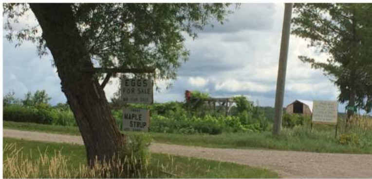
Figure 4: A Mennonite farmer selling a variety of products at the farm gate

Not only do the Mennonite families in Bruce Mines have a strong sense of community, they also have strong connections with their communities in southern Ontario. Interviews indicated that they frequently write to, and on occasion, visit their families in southern Ontario. These strong connections have allowed the Mennonite communities both in northern and southern Ontario to band together and purchase supplies, such as seeds, in bulk from a single distributor. The supplies are typically shipped to the families in southern Ontario, who then hire a driver to transport the necessary supplies to the families in northern Ontario. This has allowed the Mennonite families to purchase products at a cheaper rate than what they may have cost if bought locally in northern Ontario. With a driver dedicated to serving the needs of and connecting the Mennonite families across the province, many opportunities are possible to transport not only supplies, but perhaps final products from the northern communities for sales in southern areas.