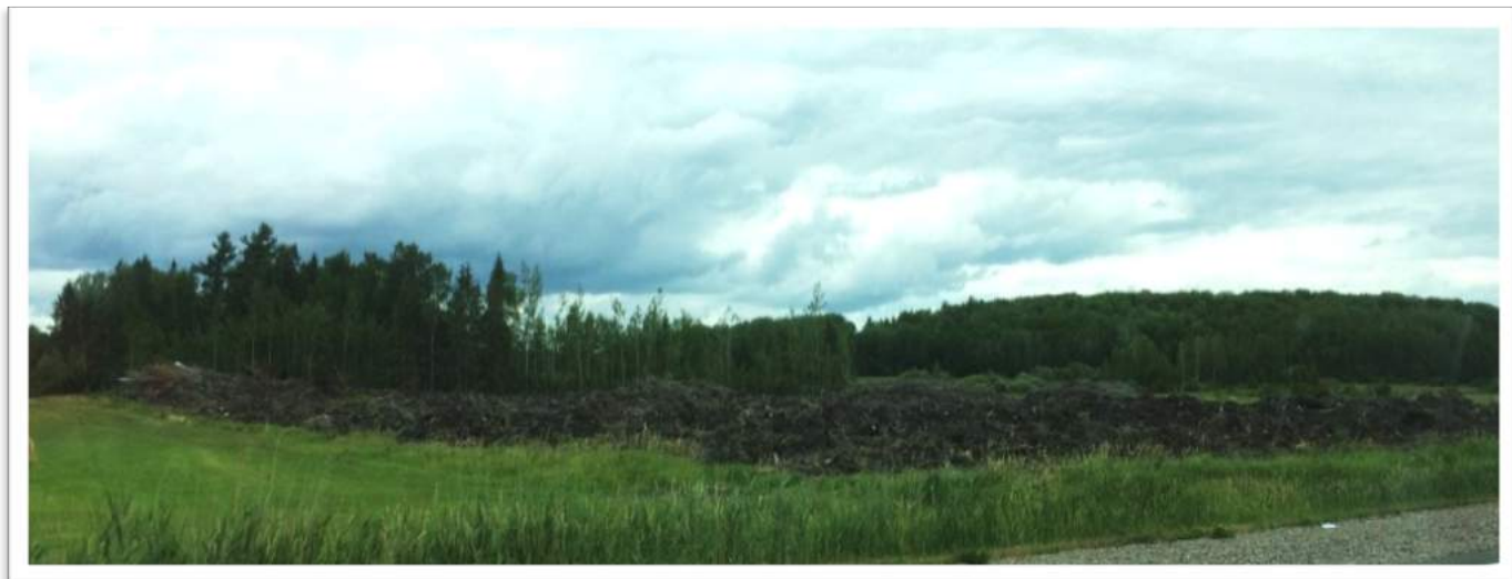
Figure 9: A forested area being cleared for agricultural purposes

“When you’re in northern Ontario, Ontario is local.” 4