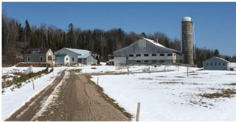
Figure 5: Northern Ontario may benefit from climate change, as warmer weather could extend the growing season