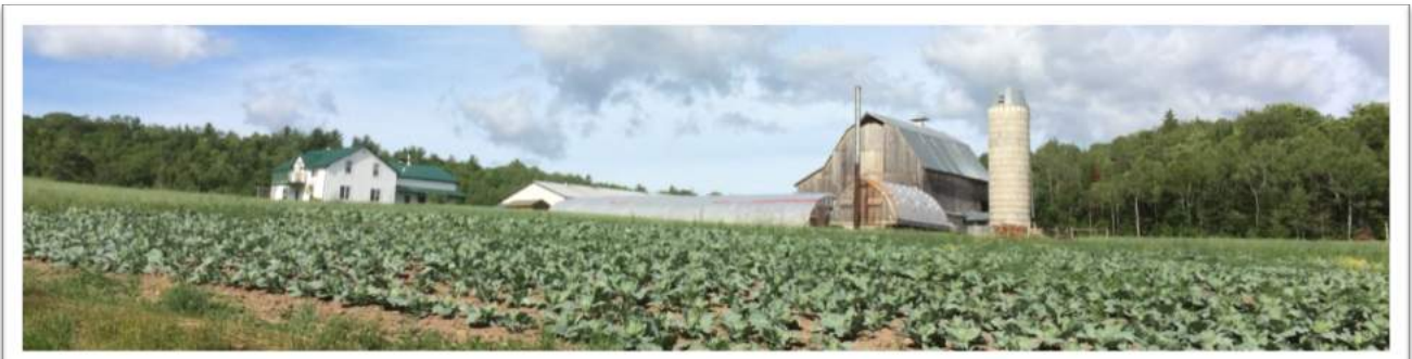
Figure 2: A Mennonite farm in Algoma District

The limited number of suppliers, truckers, and abattoirs in the Bruce Mines region have created low levels of competition amongst the various businesses. Information collected from the interviews suggests that a majority of the suppliers, truckers, and abattoirs in the area charge a premium for their goods and services. These premium prices are further examples of costs that reduce profits the farmers could potentially make. Low levels of competition are a significant challenge impacting many farm-related industries in northern Ontario. For example, there is one equipment dealership servicing the area, one regular truck driver in the area, one seasonal auction house and one local abattoir. Each business sets their own rates and given the lack of competition, farmers have no option but to pay their fees.