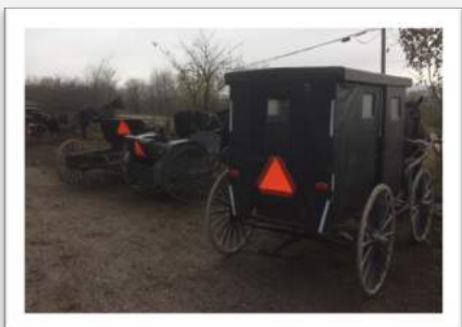
Figure 1: Anabaptist farmers arriving for the focus group

Interview preparations began with contacts in southern Ontario, who provided a map of Algoma District with the names and locations of farmers who had migrated. These initial contacts resulted in thirteen farmers participating in interviews in April 2016. Following these interviews, a draft SWOT analysis was produced and a focus group was arranged in November 2016 to provide these participants an opportunity to comment on the findings of the initial interviews. Seven farmers participated in the focus group and this report reflects their feedback.