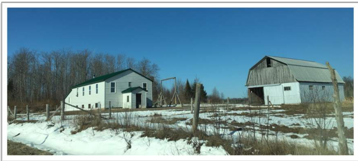
Figure 12: Many buildings within this community are of simple construction without indoor bathrooms, plumbing or electricity

With recent growth in the Bruce Mines area, the local school board has built a new school for the children. This new structure has increased the tax burden for all the property owners within the local townships. Even though the Mennonite population chooses to operate their own, self-funded school system, they are still required to pay higher taxes to support the costs associated with the new public school building. This is one example of increases in taxes that the Mennonites in northern Ontario have faced since settling in the area. As more people move to the area, a larger burden will be placed on current infrastructure and significant financial investments will be necessary. As such costs typically get passed onto tax payers, increased property taxes may threaten the viability of farms in the region.