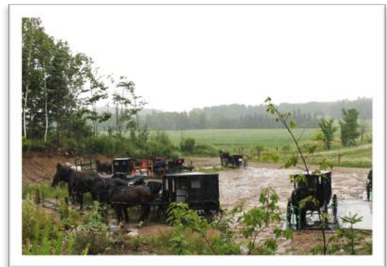
Figure 7: Horses and carriages outside the Algoma Produce Auction

During the interviews, many interviewees involved with the produce market stated that a new produce auction was set to begin in July 2016. The goal of the produce auction was to attract larger wholesalers to bid against each other for the produce. The farmers intend to continue with the current system of the produce market but want to add an auction system to the mix. With a continued reliance on southern Ontario for cheaper food, the Mennonites are hoping that offering larger quantities of produce to wholesales will allow these wholesalers to bid on and potentially purchase their produce locally at competitive rates. Targeted sales to retailers and independent grocers will continue to be made through the existing produce market stand. Multiple interviewees expressed concerns with the auction system, but overall, the farmers remained positive. In the focus group, participants noted that the auction did not perform as well as anticipated but that this was only the first year and they were committed to running it for five years. Of importance, the lack of marketing of the auction, while deliberate so as not to oversell the endeavour, proved to limit participation from larger buyers and sales were low as a result. Many auctions also included spectators who viewed the process but did not purchase any goods. The produce auction will continue in 2017 and the community is optimistic regarding its future. 3