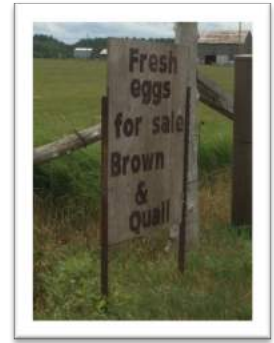
Figure 4: Eggs for sale at the farm gate

Many northern Ontario communities do not have the opportunity to purchase local food and instead, food is shipped in throughout the year. With the growth of agriculture, and local food system, these communities should soon be able to enjoy the benefits of more locally grown food. The Mennonite farmers in Bruce Mines have capitalized on the idea of growing local food for the surrounding communities by establishing and supporting many farmers' markets in the region. It seems that, across the province, the rates of direct purchase from farmers' markets and roadside stands is increasing. Farmers were aware of these increasing sales, noting that purchases are made by both residents and tourists whose plans are specifically organized around agritourism.