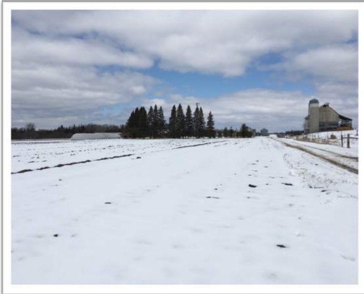
Figure 10: Transportation costs increase during the winter, as some roads are not maintained and accessibility becomes an issue