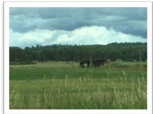
Figure 3: A horse and carriage in a farmer's field

At this time, although there are plenty of children in many of these households, the majority of these kids are too young to work in the field and as a result, extra pressure is placed on the elders, parents, and older children. Within the next five years, this situation could change as the children become old enough to work on the farms. Further, the size of the community is expected to continue to grow which could help the area produce enough food to sell to major retailers and provide additional farm labour.