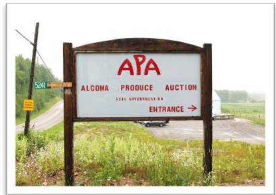
Figure 8: Algoma Produce Auction